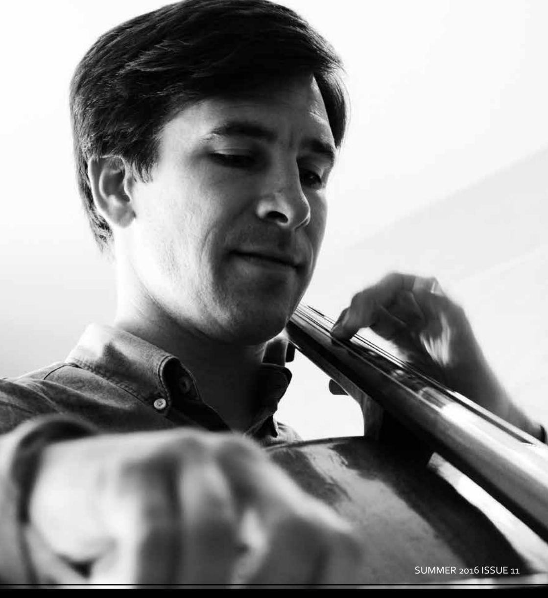
Et Cetera THE NEWS MAGAZINE OF HOLLAND PARK SCHOOL